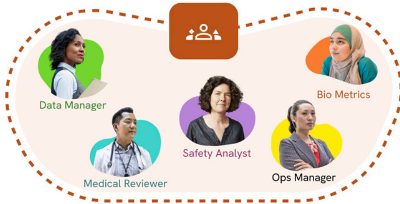
Figure 3 – Integrated collaboration: Record & communicate decisions.