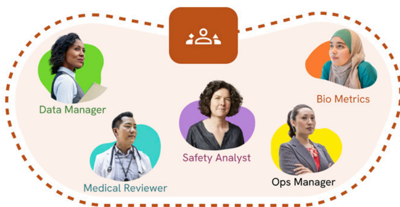
Figure 3 – Integrated collaboration: Record & communicate decisions.