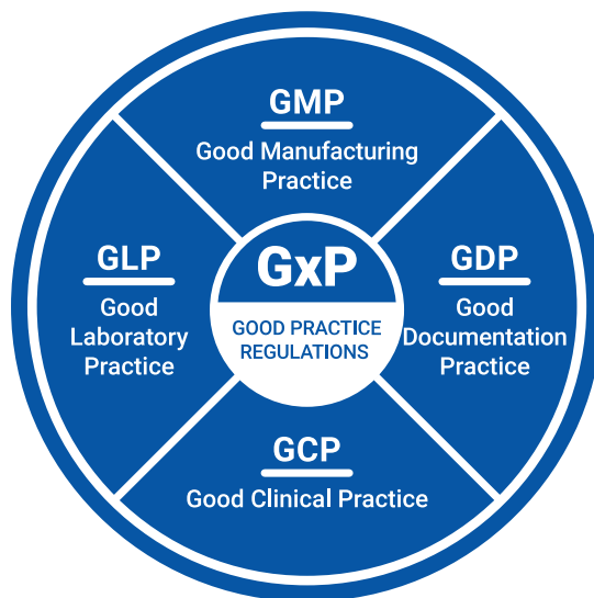
Figure 1. GxP: FDA’s good practice quality guidelines and regulations for various stages of product development and manufacturing.

IGxP can also be thought of as a combination of functionality that helps scientists in regulated environments work more efficiently and confidently (i.e., software features that assist in day-to-day lab activities), and capabilities that help enforce compliance with regulations.