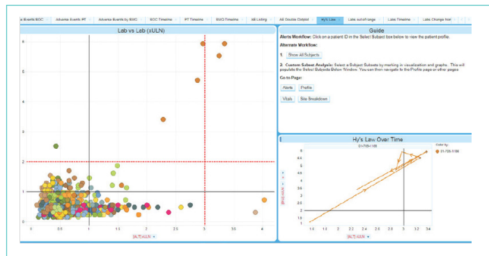
Dynamic Hy's law visualization to quickly identify subjects with possible drug-induced liver injury.

Revvity's Clinical Data Review, with in-stream review of data aggregated across domains, ensures optimal decision making on safety and efficacy, early in the clinical data review process.