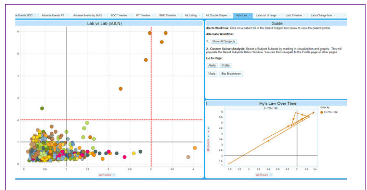
Dynamic Hy's law visualization to quickly identify subjects with possible drug-induced liver injury.

Revvity's Clinical Data Review, with in-stream review of data aggregated across domains, ensures optimal decision making on safety and efficacy, early in the clinical data review process.