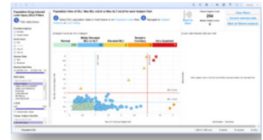
Clinical Data Review

CLINICAL OPERATIONS. Enhance operational effectiveness with timely visual insights into study start-up, recruitment, site performance, budget, milestone tracking and more. Identify and communicate study status and potential challenges to the entire team. View operational insights at the portfolio, country, and study level.