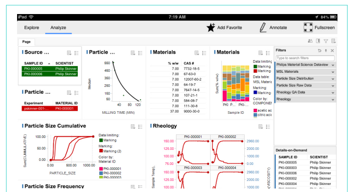
A material science dashboard exposed on an iPad®, combining particle size and rheology results in a single interactive view.

Spotfire® software meets the analytic needs of users across the enterprise – from data discovery and ad-hoc analysis, to interactive reporting and dashboards, to domain-specific applications, to event-driven real-time analysis, and powerful predictive analytics – all from a single architecture.