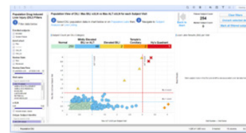
Clinical Data Review

CLINICAL OPERATIONS. Enhance operational effectiveness with timely visual insights into study start-up, recruitment, site performance, budget, milestone tracking and more. Identify and communicate study status and potential challenges to the entire team. View operational insights at the portfolio, country, and study level.