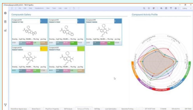
Figure 1. Visualization tools to compare formulations

Revvity Signals' solutions for food, flavor, and fragrance accelerate R&D innovation, enabling new ingredients and products to reach the market rapidly, reliably, and with maximum ROI.